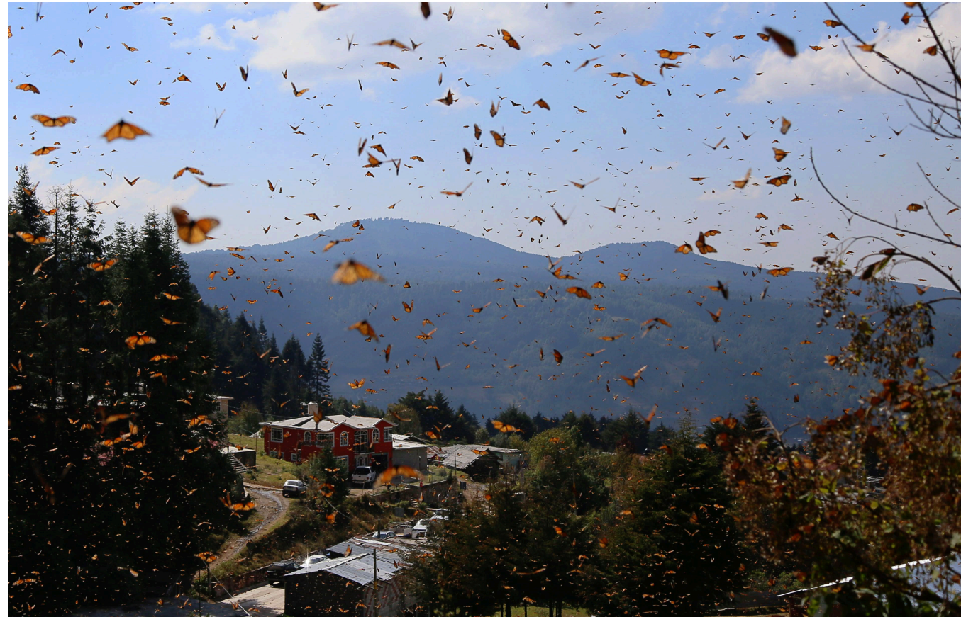
FLUTTER SPEED MEETS SHUTTER SPEED Monarch butterflies fill the air around on the mountaintops in the Monarch Butterfly Biosphere Reserve, a UNESCO World Heritage Site in Michoacán, Mexico.

The migratory monarch butterfly, a subspecies of the monarch butterfly, was recently added to the IUCN's Red List as an endangered species, due to pressures from habitat loss and climate change.